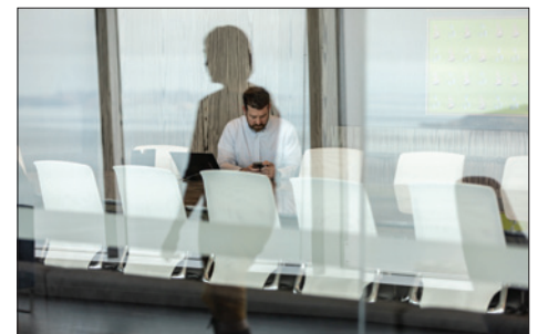
A conference room in McDermott Will & Emery’s new San Francisco office.